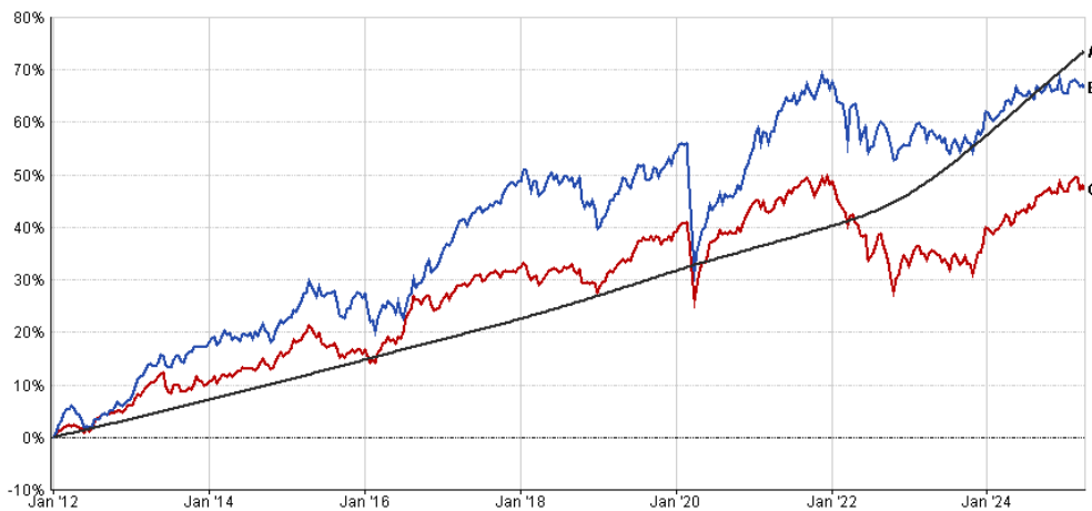
■ A - Bank Of England Base Rate + 3% TR in GB [73.62%] ■ B - Athena Controlled Risk Portfolio IV 22/07/2024 TR in GB [66.58%] ■ C - IA Mixed Investment 0-35% Shares TR [47.31%]

Performance calculated for Athena Active Cautious (Athena IV) is the total return net of all underlying fund charges and gross of other fees and is based on Apollo's central 'core/satellite' portfolio strategy. Actual performance may vary depending on adviser charges, the platform selected and on fund availability. The benchmark is Bank of England Base Rate + 3, while the representative sector for reference only is IMA Mixed Investment (0-35%). Ratios are calculated on a monthly basis.